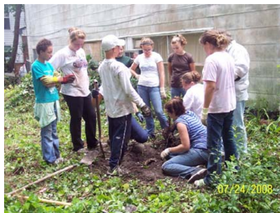
Backyard Weeding Project with our BARE Hands and a couple of shovels!