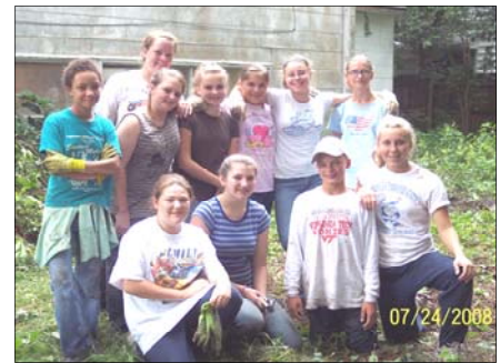
Our Team with students from Aaron's Creek Baptist Church.