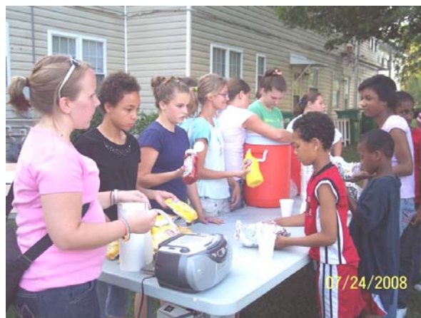
Serving refreshments at Night Camp

Five students and two chaperones attended this high energy conference July 31-August 1, held at the Richmond International Raceway. Hundreds of students enjoyed music, games, and awesome messages from the speakers. On Thursday night, our group stayed at the Best Western, which gave us time to relax a little. On Friday, the conference ended at lunch time and most participants headed to King's Dominion for a day of roller coasters and water park fun!