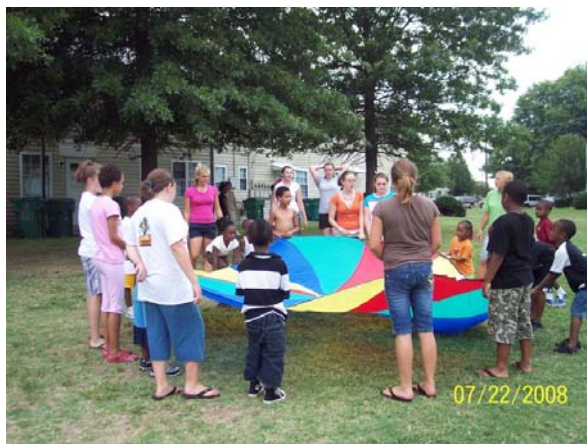
Using our parachute with children during our Night Camp.