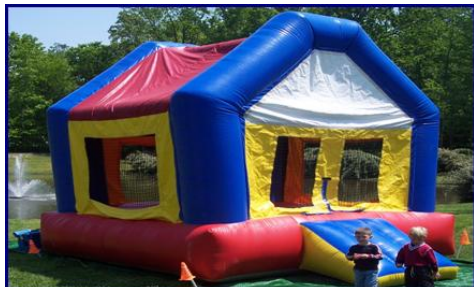
Try the Moonwalk!

This event is coordinated by Millfield's Outreach Committee . The purpose is to provide a fun and relaxing event for Millfield's members and neighbors to attend. We hope the event will help new people become better acquainted with our church, but that hope will only be fulfilled if those who are part of Millfield bring (not just invite) your friends. Join us for a few hours of relaxation and enjoy yourself! Bring your neighbors, friends & family.