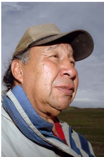
A Lakota Indian