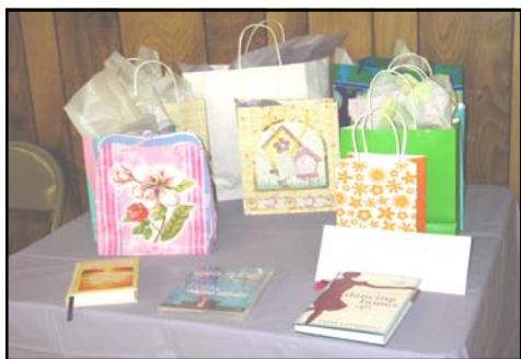
The door prizes were awesome!