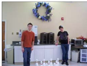
Bowling at the Nursing Home