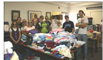
At the Clothes Closet