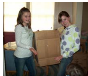
Helping a Neighbor