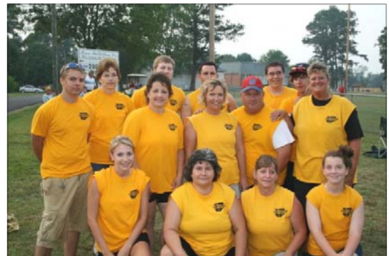
Softball Team 2008